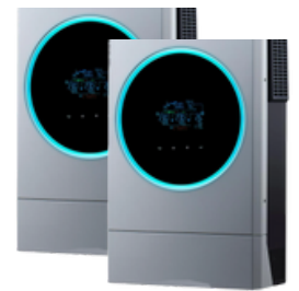
Two inverter, charger, controller units