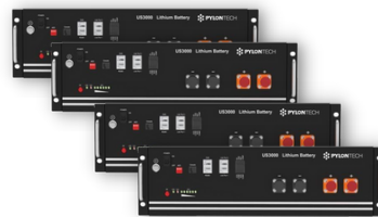
4 to 8 Battery Modules

We are manufacturers - not installers however we have a network of approved installers in most regions who will quote you direct. Please get in touch to learn more.