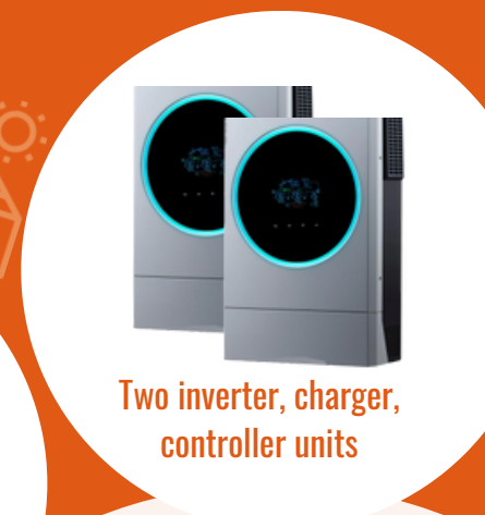
Two inverter, charger, controller units