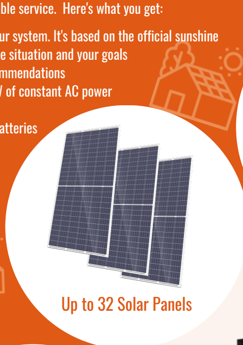
Up to 32 Solar Panels

We are manufacturers - not installers however we have a network of approved installers in most regions who will quote you direct. Please get in touch to learn more.